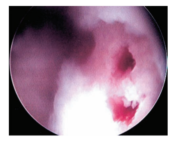
Figure 3. Arthroscopic image of marrow elements flowing through microfracture holes after tourniquet release.

Postoperatively, we did not use constant passive motion (\mathrm{CPM}) to avoid stiffness, as is commonly utilized after microfracture in the knee. ^{36} Patients were provided sling immobilization for 2 to 4 weeks for comfort. Passive range of motion with progression to active assist and active range of motion was allowed and encouraged immediately after surgery. Standard protocol included a request for immediate pendulum exercises for at least 800 rotations per day. Light strengthening was initiated at 6 weeks if range of motion had been restored, with progression to unrestricted strengthening at 12 weeks postoperatively. All activities were allowed at 16 weeks, but overhead competitive athletics were restricted for 6 months.