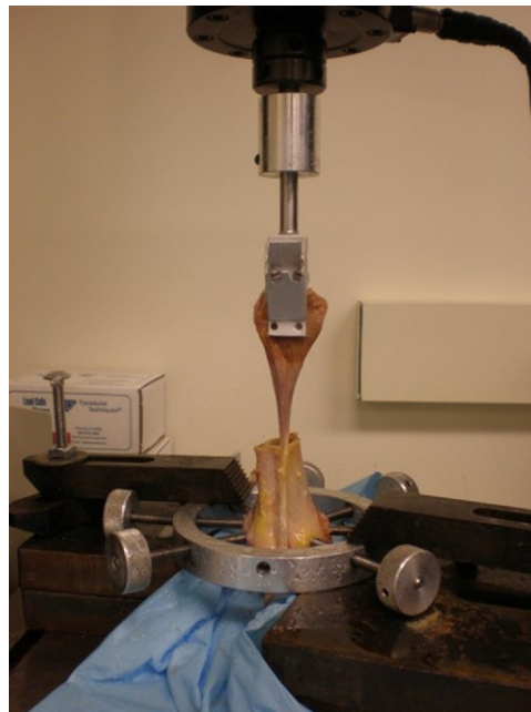
FIGURE 2. Setup of biomechanical testing of biceps tenodesis model (proximal group). The proximal humerus is inferior and the biceps tendon and muscle are superior, held by a clamp in the MTS machine. The MTS machine tested the biceps longitudinally in line with the normal pull of the biceps muscle.

Dry ice was placed within the chutes of the cryo-clamp just before testing to securely grasp the biceps muscle belly. Then, using a previous study 11 as a model with the specific testing parameters modified